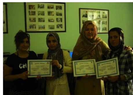
Awarding the computer course graduates with certificates

Number of the youth benefited from internet services were 253 people.