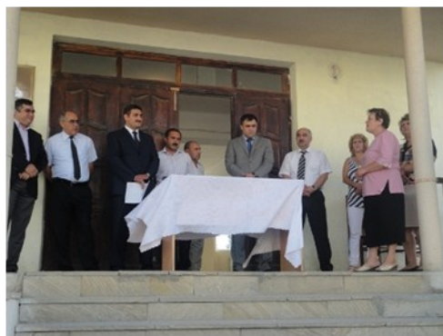
Opening ceremony of the project

Completion of construction and education part of the project came across with the beginning of education year in Azerbaijan, and an opening ceremony was organized on September 10, in the eve of the beginning of the education year. The opening ceremony was organized jointly with Binagadi ExCom.