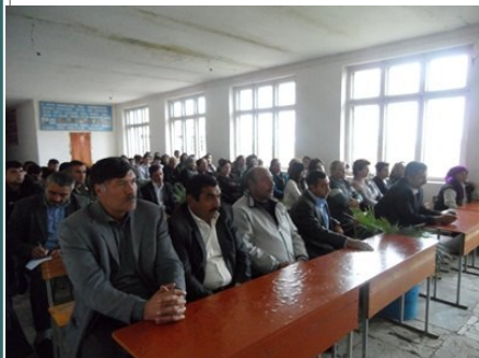
Common community meeting in Ashigalilar community of Beylagan rayon

During the quarter, activities continued in the communities targeted under SEDA project, i.e. common community meetings were conducted for disseminating the information about the project and electing CDC members, as well as trainings and round tables were organized for building capacities of CDC members. Moreover, various events were organized and discussions were held with the CDC and community members for assessing the communities' needs, conducting the surveys and developing the project proposals.