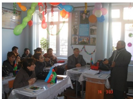
Meeting in Khalaj community in Sumgayit

Computer courses and internet services - Computer courses on three computer programs have been planned to be organized: MS Office 2007, Adobe Photoshop and Corel Draw. During the first quarter of the project's implementation, number of the applicants for the computer courses were 17 people in Baku, and 50 people in Sumgayit. Much more interest was displayed for Office programs, i.e. number of the youth who had applied for the courses on Office programs was 14 people.