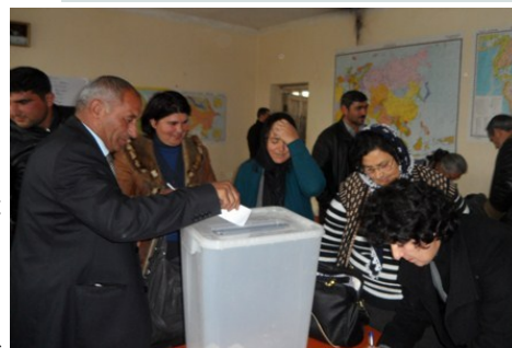
CDC election in Ashagi Chemenli community of Beylagan rayon

Building partnerships Creating economic opportunities Developing capacities Engaging civil society