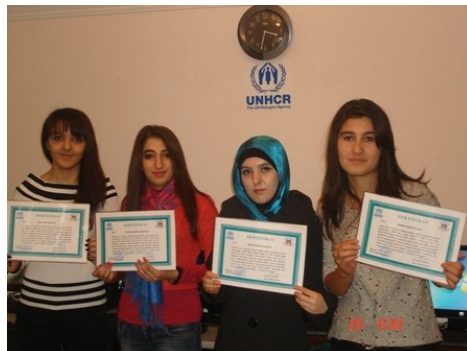
Awarding the apprenticeship course graduates with certificates

The project goals were achieved through the following two activity directions during the last quarter of the project: