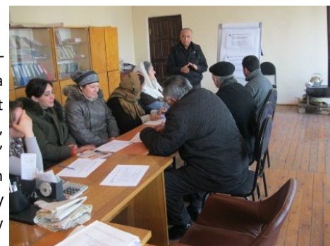
"Mobilization" training in Charkhi community of Khachmaz rayon