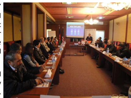
"Value Chain of Milk - opportunities, development perspectives and problems" Conference

In sum, 279658 litres of raw milk was collected from more than 250 husbandries located in the target communities and sold to MPFs during the quarter, which earned 114660 AZN for the target communities. And this means that every husbandry's income from sale of milk comprised about 150 AZN per month.