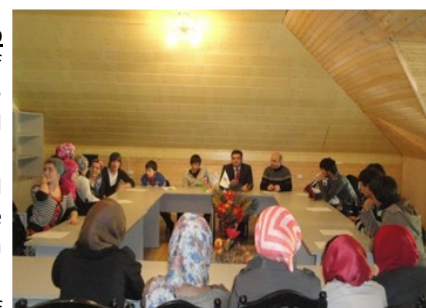
Meeting in the RWYC in Baku

Umid plans to cover a total of 1330 direct beneficiaries - 600 refugees in Baku and 730 IDPs in Sumgayit cities. Considering indirect beneficiaries, the ultimate number of beneficiaries is expected to reach 4,000 people.