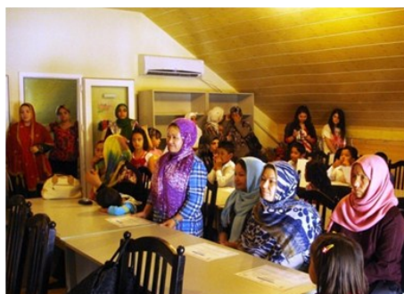
Meeting with parents of the children of international summer camp in the RWYC