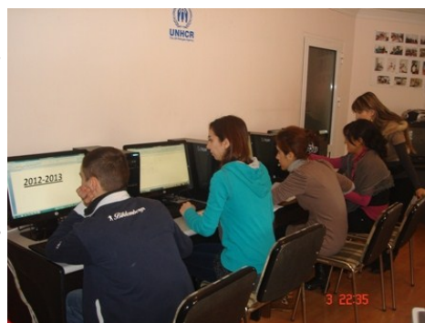
Computer training for IDP youth in "Umid" SSD's Sumgayit Office

The purpose of an apprenticeship is to provide both hands-on training and theoretical instruction so that an interested person can learn the full range of skills and information behind a highly skilled occupation. By participating in an apprenticeship, he can learn the subtleties of the craft from an expert and can begin his own practice under close observation.