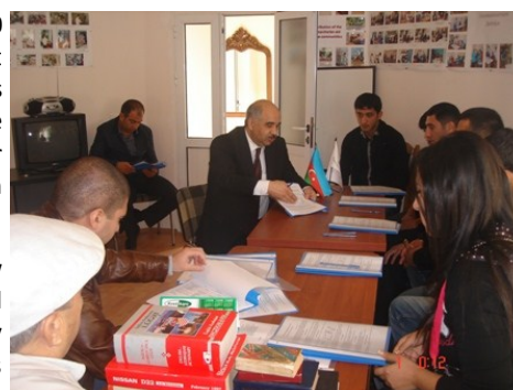
Providing grants to the apprenticeship course graduates

During October-December of 2012, 59 youth benefited from free internet services organized in "Umid" SSD's Sumgayit Office for the youth. In sum, 206 youth and adolescents benefited from free internet services throughout the project's implementation.